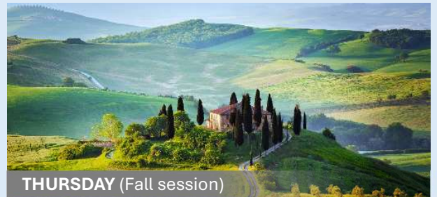
THURSDAY (Fall session)

Trip to 5 Terre: A trip to explore the characteristic villages of Vernazza, Monterosso and Manarola and admire the unique panorama of the Liguria coast.