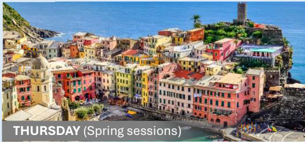
THURSDAY (Spring sessions)

Galleria dell'Accademia: One of the most visited museums in Florence, home to the original Michelangelo's statue of David.