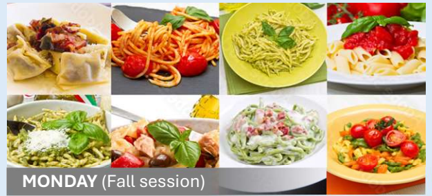
MONDAY (Fall session)

Lecture: The Italian Music: A lesson about the music that have excited generations of Italians and will help you get deeper into the Italian music culture.