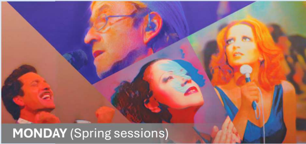
MONDAY (Spring sessions)

Lecture: The Italian Music: A lesson about the music that have excited generations of Italians and will help you get deeper into the Italian music culture.