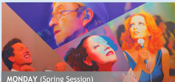
MONDAY (Spring Session)

Seminar: The Italian Music: A lesson about the music that have excited generations of Italians and will help you get deeper into the Italian music culture.