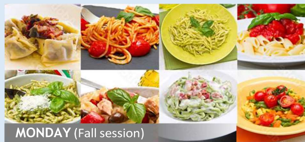
MONDAY (Fall session)

Basilica di Santa Croce: The so called "temple of Italy's glories", a truly unique hub of Faith and Art in the Franciscan church hosting the funeral monuments of Italian historical figures.