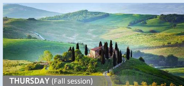
THURSDAY (Fall session)

Galleria dell'Accademia: One of the most visited museums in Florence, home to the original Michelangelo's statue of David.