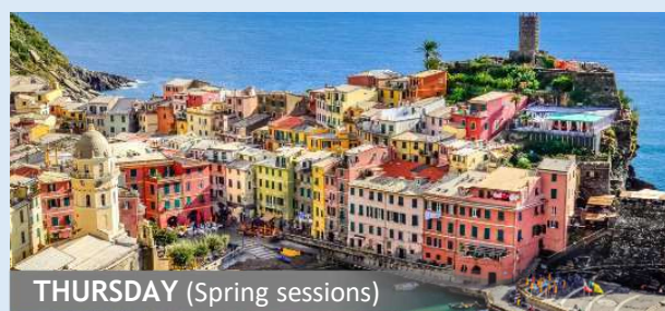
THURSDAY (Spring sessions)

Chianti tour: A trip to Castello di Verrazzano to visit its renaissance gardens and historical Chianti cellars. After the tour, enjoy a selection of wines.